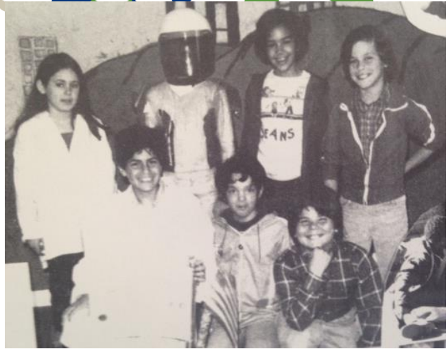
Photo from the 1979 Sterne yearbook

Sterne Graduation Thursday, June 8, 2017 245 Valencia St., San Francisco 8 th Grade Ceremony 10:00 am High School Ceremony 12:00 pm